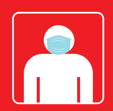
Wear face mask