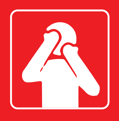
Avoid touching your eyes, nose and mouth