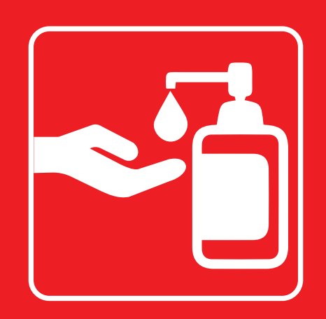
Treat your hands with antiseptic