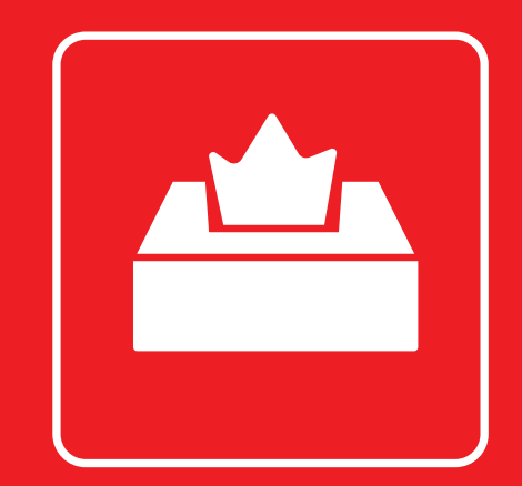
Use tissue when cough / sneeze