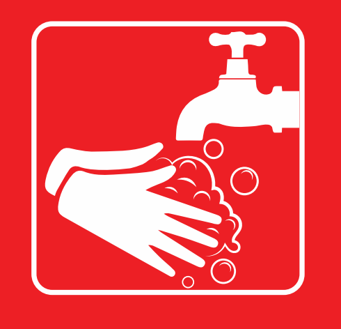
Wash your hands frequently with soap and water